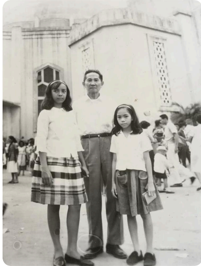
With our Lolo in Manila