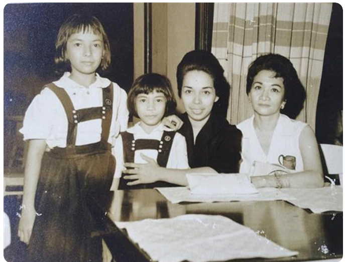
St Scho gradeschool